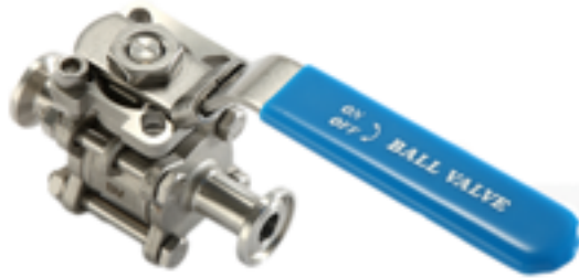
Fig no. V-Z58TC Tube Bore 1/2" - 4" DN15 ~ DN100