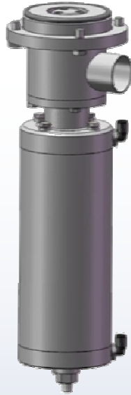
TANK BOTTOM VALVE DRAIN/BREAK SEDIMENTS